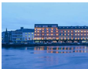
WATERFORD - Granville