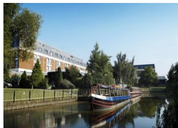
STRATFORD-ON-AVON Holiday Inn