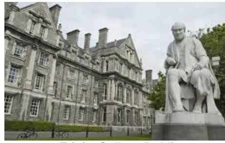
Trinity College Dublin