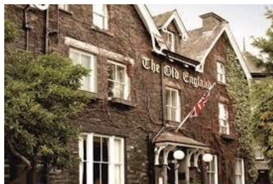
WINDERMERE-MacDonald Old England