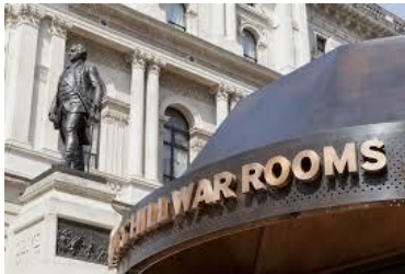
Churchill War Rooms