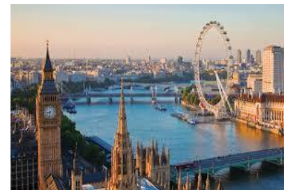
Big Ben, Parliament, London Eye