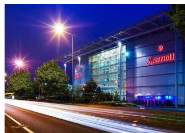
HEATHROW - Marriott