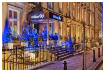
EDINBURGH - Hilton Grosvenor