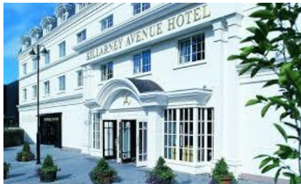
KILLARNEY - Killarney Avenue