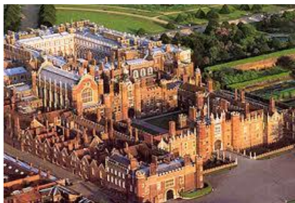
Henry VIII's Hampton Court Palace