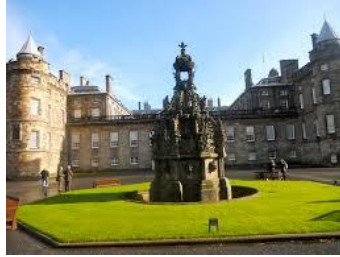
Holyrood Palace Edinburgh