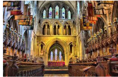
St. Patrick's Cathedral Dublin