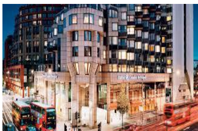
LONDON - Hilton Metropole