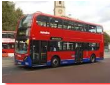
London Red Bus