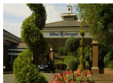
NEWPORT - Hilton