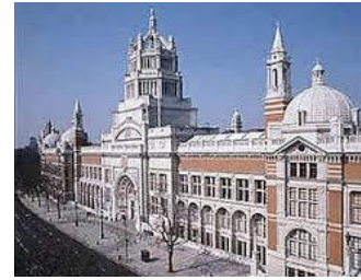
Victoria and Albert Museum