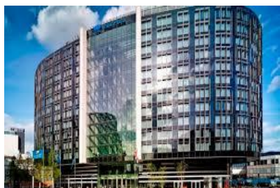
LONDON - Park Plaza Westminster