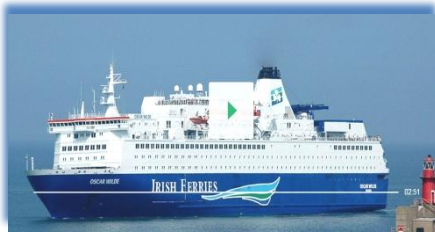
Ferries across the Irish Sea