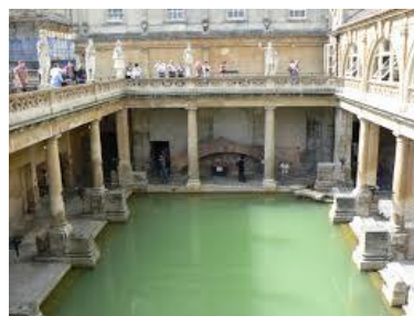
Roman excavations in Bath