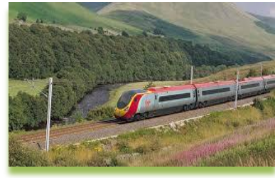
British Rail to the Lake District