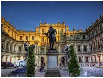
Royal Academy of Arts