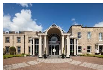
YORK - Mercure Fairfield Manor