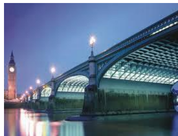
Westminster Bridge (near our hotel)