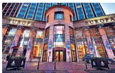
BELFAST - Europa