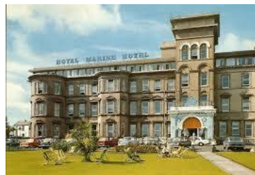
DUBLIN - Royal Marine