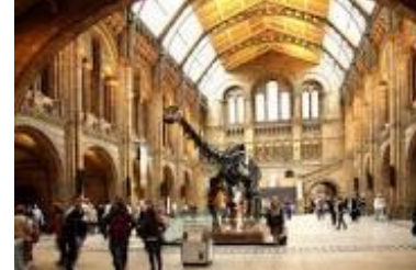
Natural History Museum