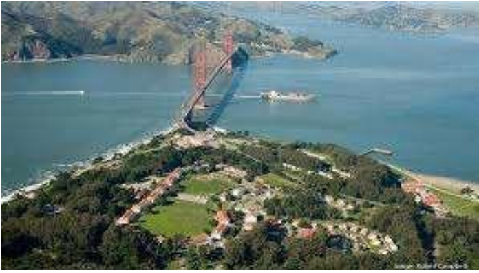
Legion of Honor and the Presidio