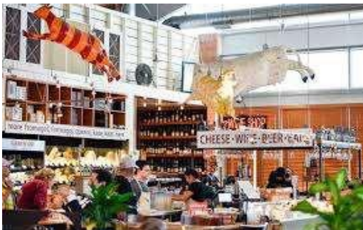
Ox Bow Center Market – Country Food Napa