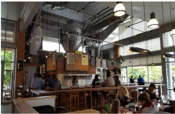
Fieldwork MicroBrews - Napa