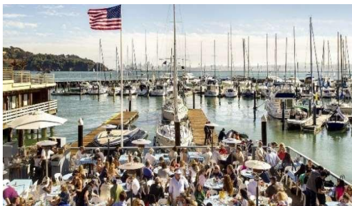
Sam's Anchor Café - Tiburon