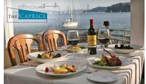
Caprice - Tiburon