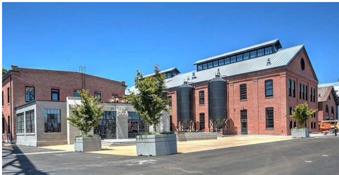
Savage & Cook Distillery – Mare Island