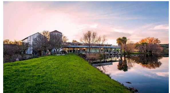
Di Rosa Contemporary Art Center - Sonoma