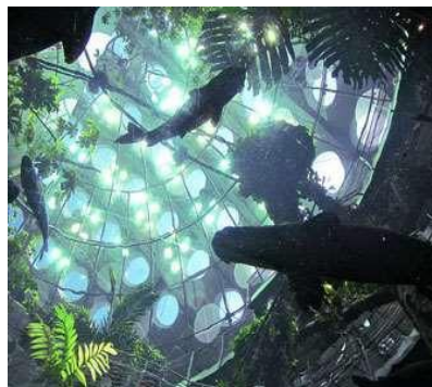
Academy of Sciences