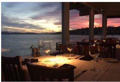
Spinnaker - Sausalito