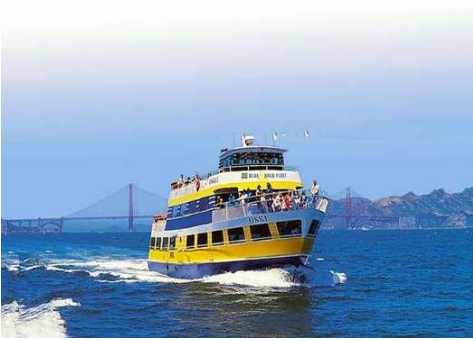
Ferry to San Francisco