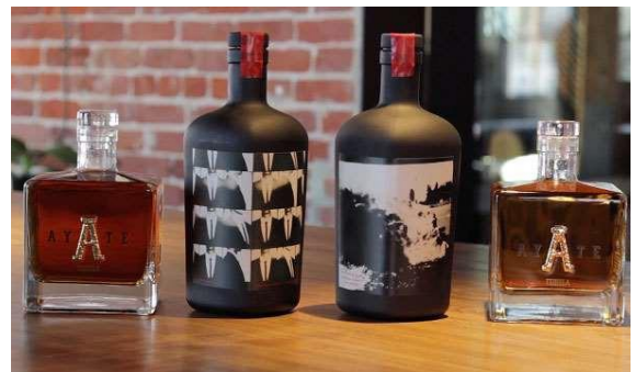
Fine Spirits: Bourbon, Whiskey and Tequila