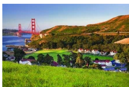
Farley's - Cavallo Point