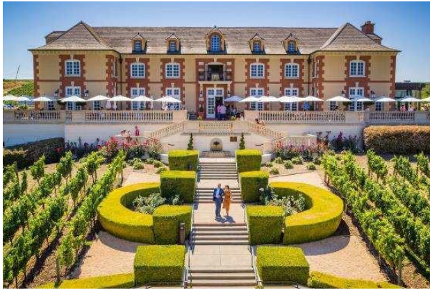
Domain Carneros Winery – Sonoma