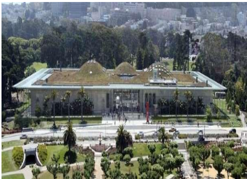
Academy of Sciences