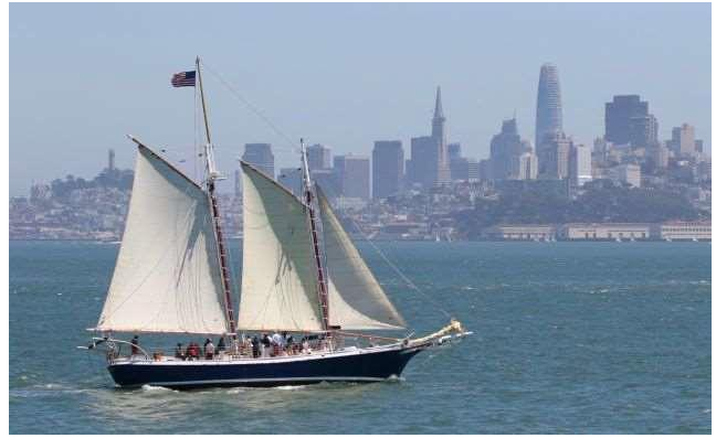
Bay Sailing on the Schooner Freda B.