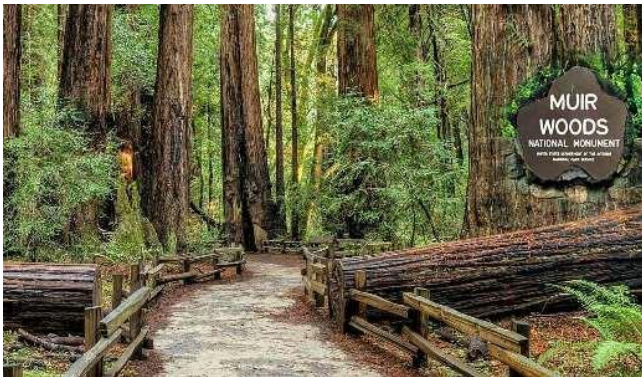
Muir Woods National Redwood Sanctuary