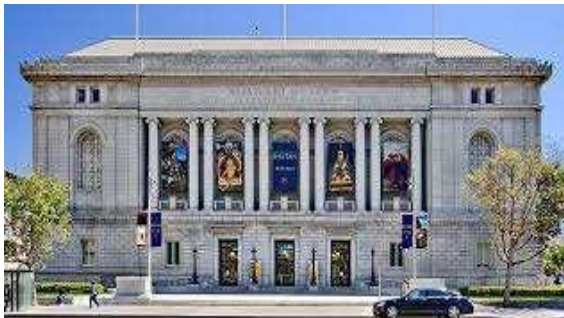
Asian Art Museum