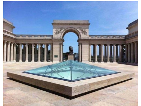
Legion of Honor - Fine Arts Museum