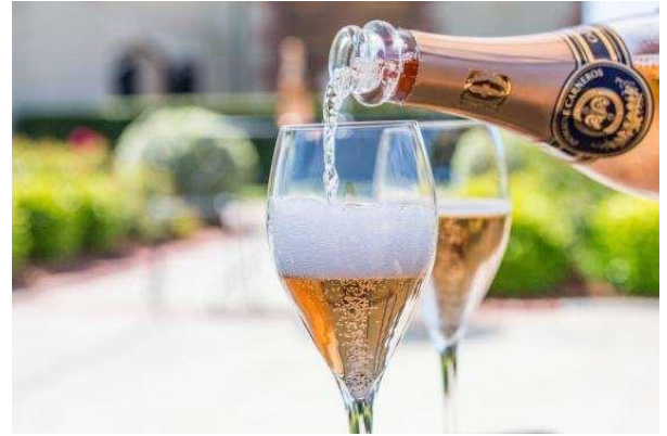
World-class California sparkling wines