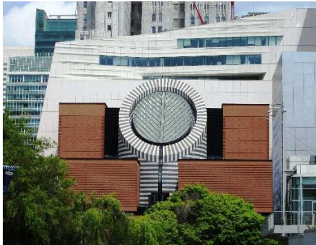
Museum of Modern Art