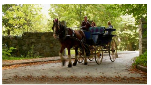
Killarney Jaunting Car wagon