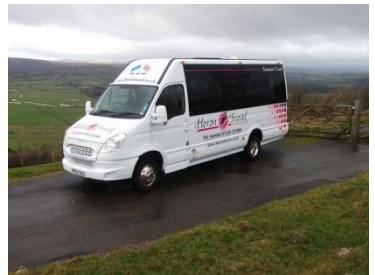
Lake District by Van