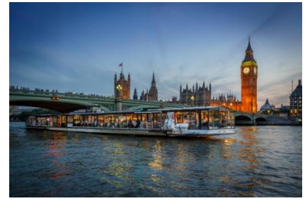
Thames River Dinner Cruise